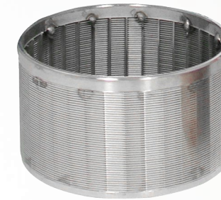
INTAKE FILTER SCREEN