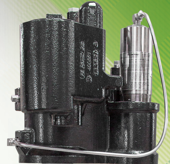
ADVANCED PROTECTION STP