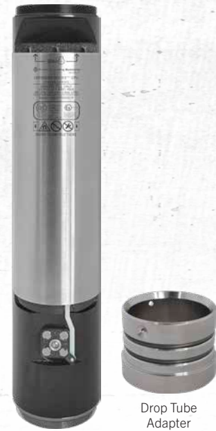
Drop Tube Adapter

The Defender Series® Overfill Prevention Valve (OPV) prevents the overfill of an underground storage tank during a gravity-fed product delivery. It employs a revolutionary magnetically-coupled actuator system to provide positive shutoff. This unique method of shutoff eliminates any penetrations in the valve, making it both vapor and leak tight. This also allows for remote compliance testing of the primary functionality at grade level without having to remove the OPV from the tank.