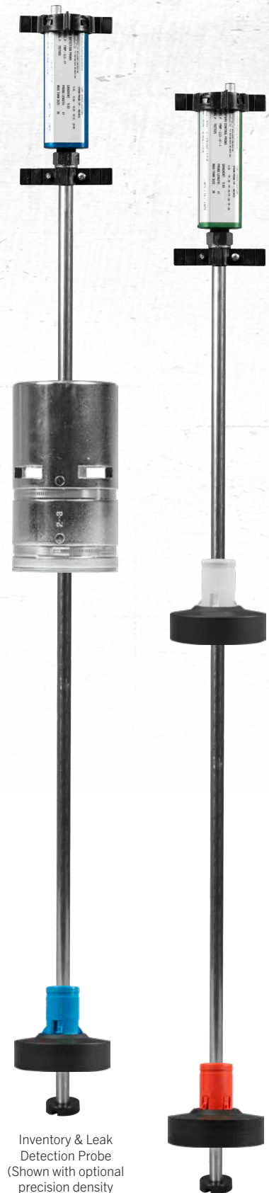
Inventory & Leak Detection Probe (Shown with optional precision density diesel float kit)