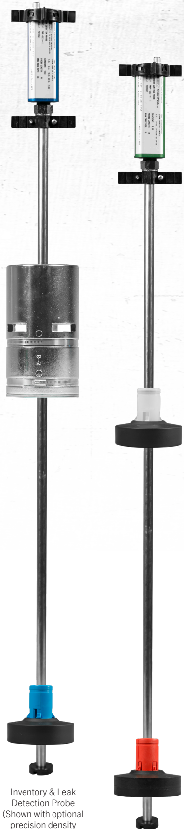
Inventory & Leak Detection Probe (Shown with optional precision density diesel float kit)