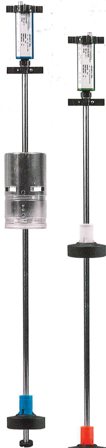
Inventory & Leak Detection Probe (Shown with optional precision density diesel float kit)